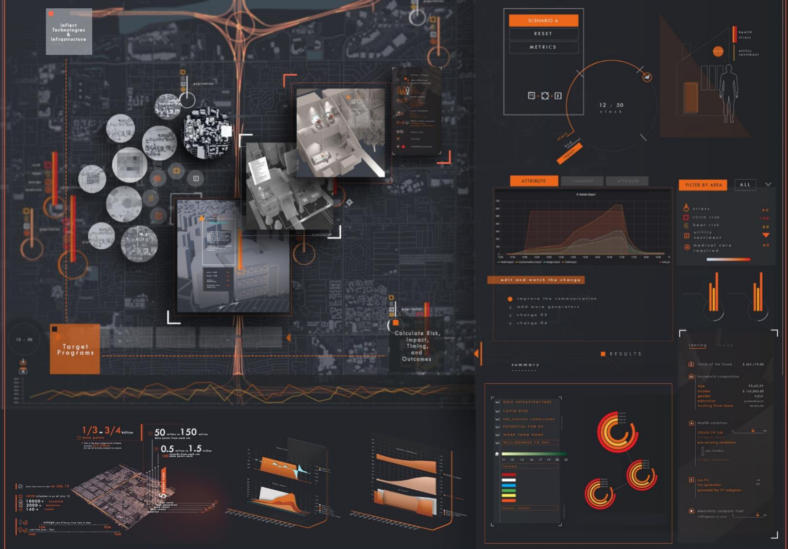
Pictured Above: sample of RWI's Incubatenergy® Dual-Disaster SSE data, project results and visuals

Those considerations include the interconnected economics, risks, performance, and resilience along with current policy and practice. The SSE recreates all of these specifics to supply in situ, in silico context and results. The SSE allows for rapid and repeated exploration of alternatives and scenarios, and quantification of high-value outcomes alongside cost implications. SSEs allow for a complete and holistic view of potential scenarios – and exploration beyond critical supply availability and duration, and the impact of technologies such as solar, microgrids, storage and uninterrupted power supplies.